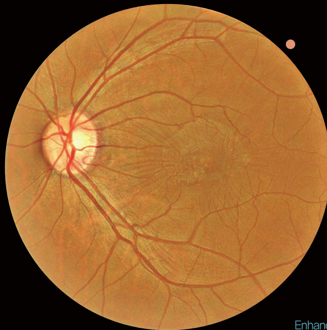
Enhanced Visualization Technology : EVT

Thanks to Low Intensity of Flash, Speedy Capturing, Auto Tracking & Auto Shooting, HFC-1 provides High Stability and Ease of Use.