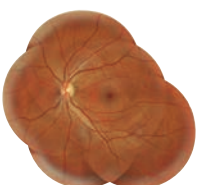
Panoramic (Non-Mydriatic Composite Retinal) Image

The function provides major information to general evaluation for eyes since users can acquire high resolution images minimizing distortion.