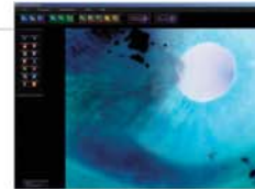
Image manipulation for maximum diagnosis

With Live Tool graphic library, all the images such as JPG, TIFF, RAW and many more formats can be adjusted for brightness, contrast, color channel, saturation, inversion, sharpness, red-free, etc.